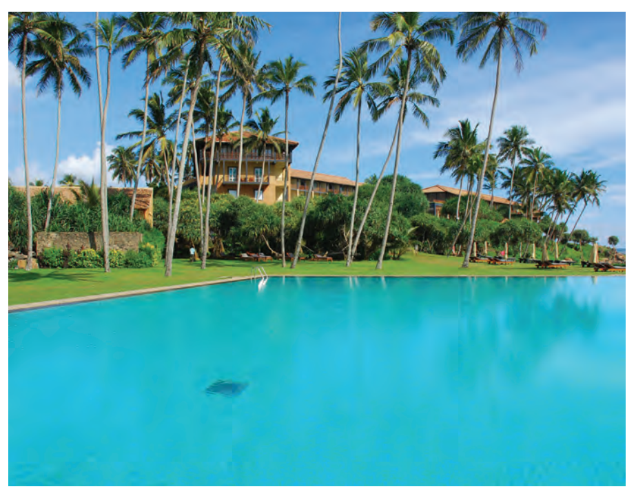
Jetwing Lighthouse, Galle