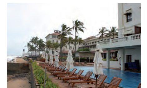
The Regency at the Galle Face Hotel, Colombo

Galle Face hotel was painstakingly restored between 2002 and 2004 and opened as The Regency at the Galle Face Hotel, adding 80 luxurious bedrooms and a Spa to this pillar of Sri Lankan hospitality. The bedrooms in The Regency are luxuriously fitted with elegant furniture, marble bathrooms, air-conditioning and modern amenities, whilst still retaining original features such as polished wooden floors, high ceilings and whitewashed walls. The Oceanic suites look directly onto the sea. read more