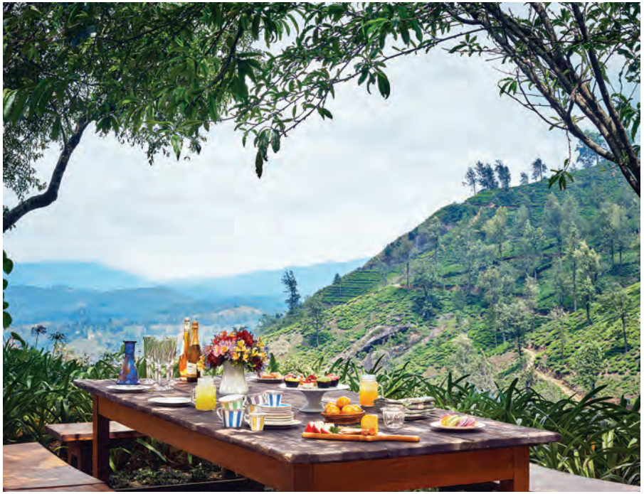
Jetwing Warwick Gardens, Ambewela